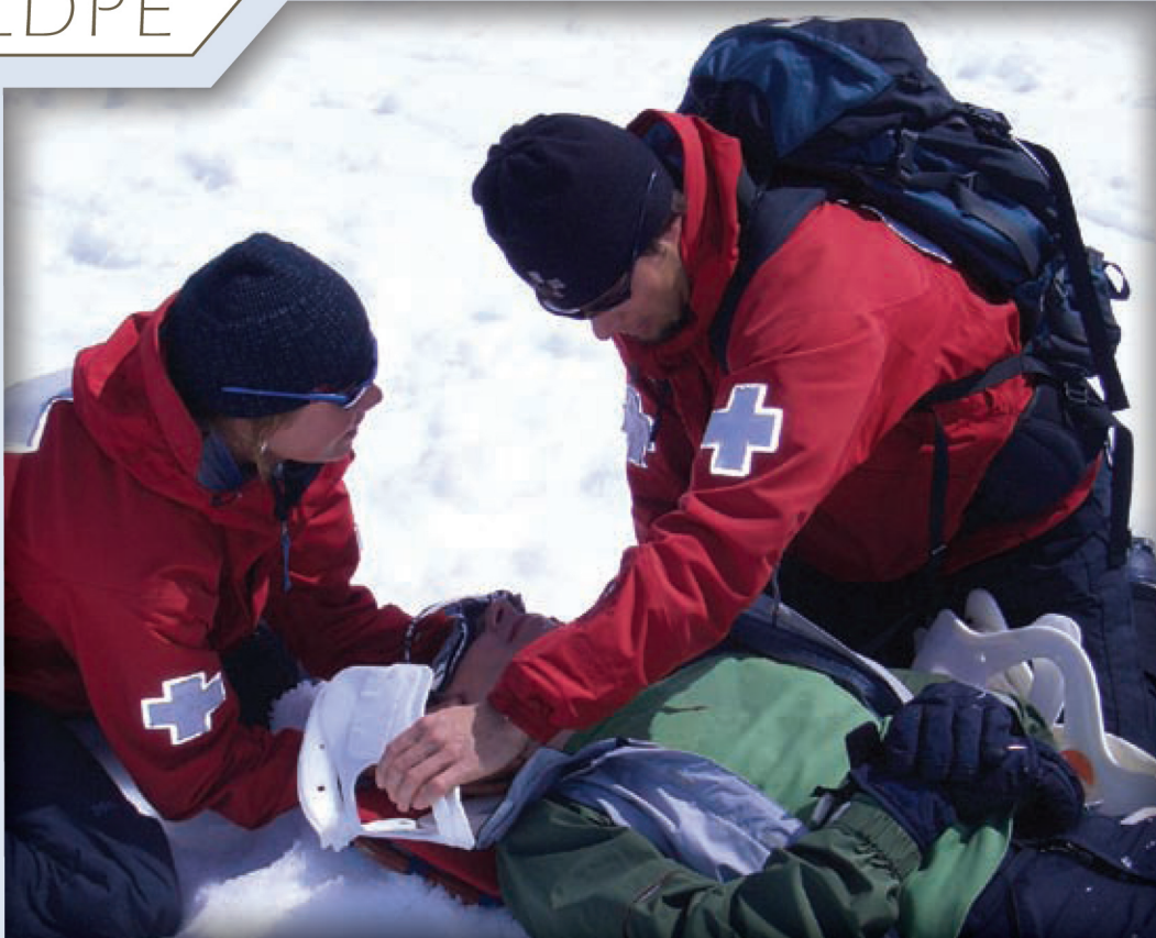
Low Density Polyethylene Sheet