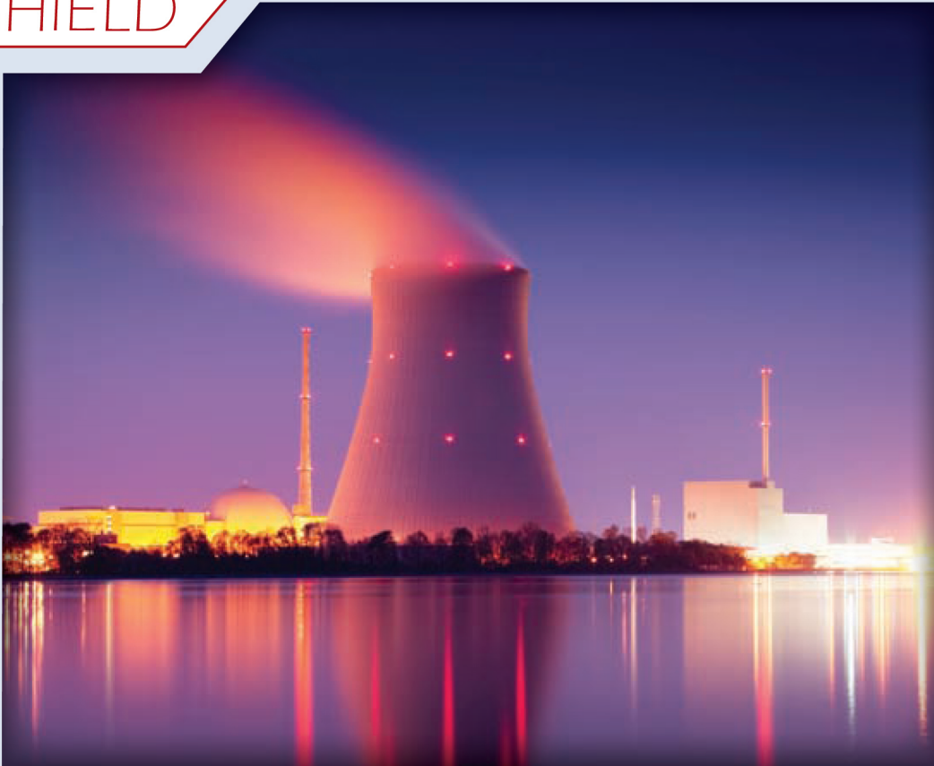
Borated Polyethylene Sheet