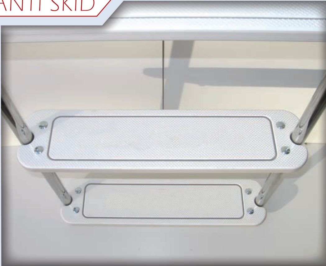
High Density Polyethylene Sheet – PE 300