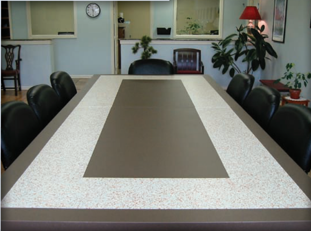
Recycled Post Consumer High Density Polyethylene Sheet – PE 300