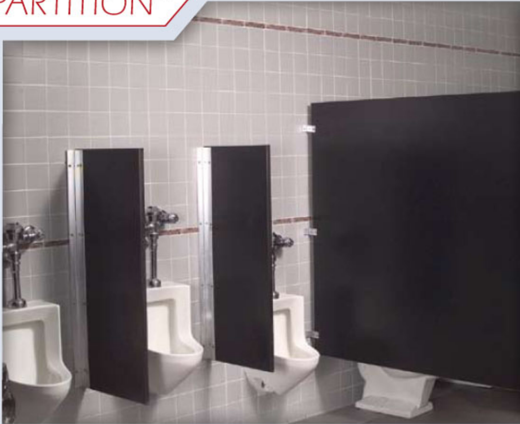
High Density Polyethylene Sheet – PE 300