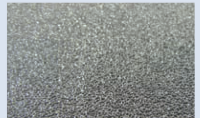
Desert Sand Finish