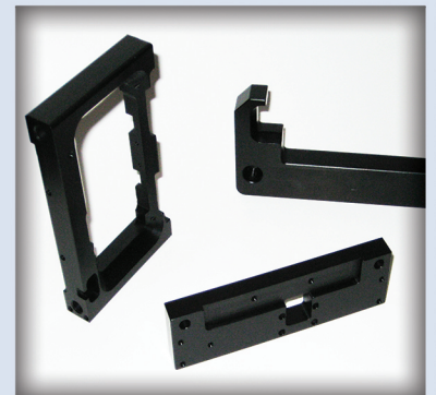
Great dimensional stability