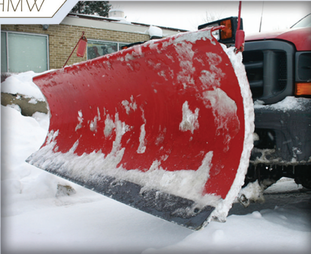
High Molecular Weight Polyethylene Sheet – PE 500