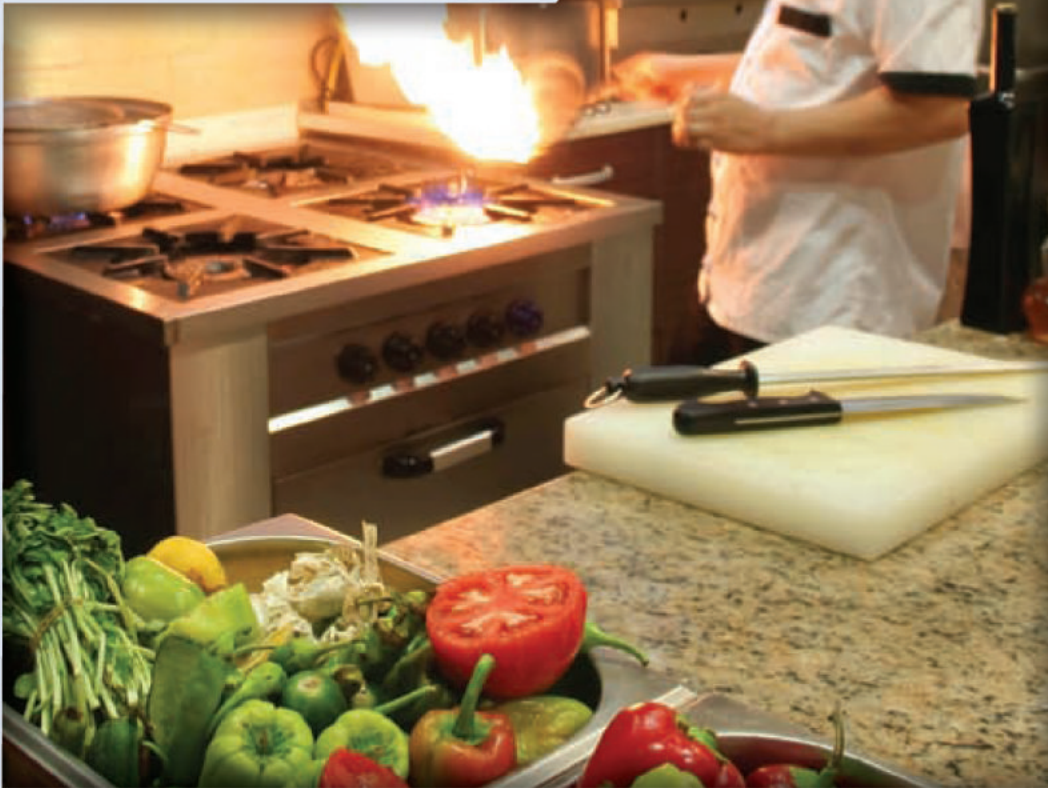
High Density Polyethylene Sheet- PE 300