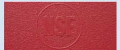
NSF Logo Finish