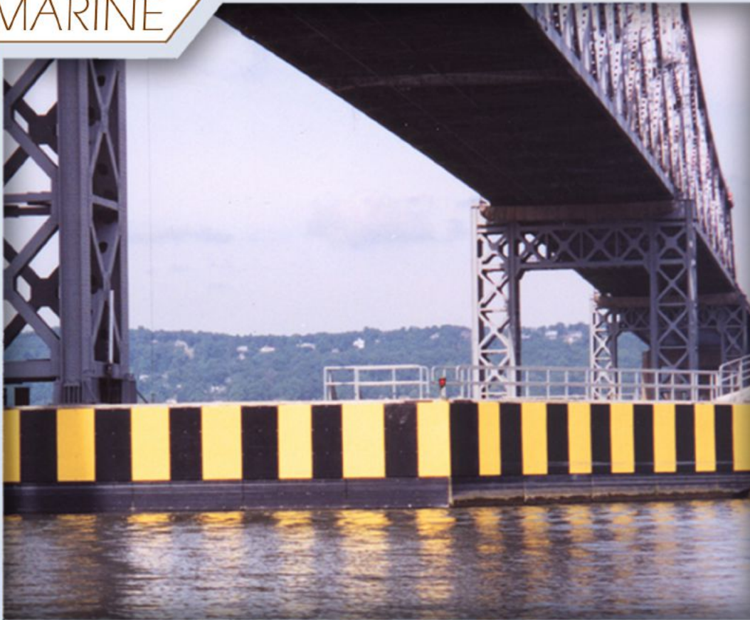
Ultra High Molecular Weight Polyethylene Fendering