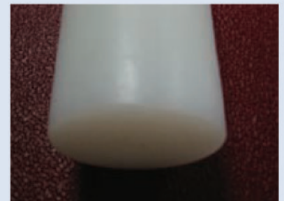
Smooth as Extruded