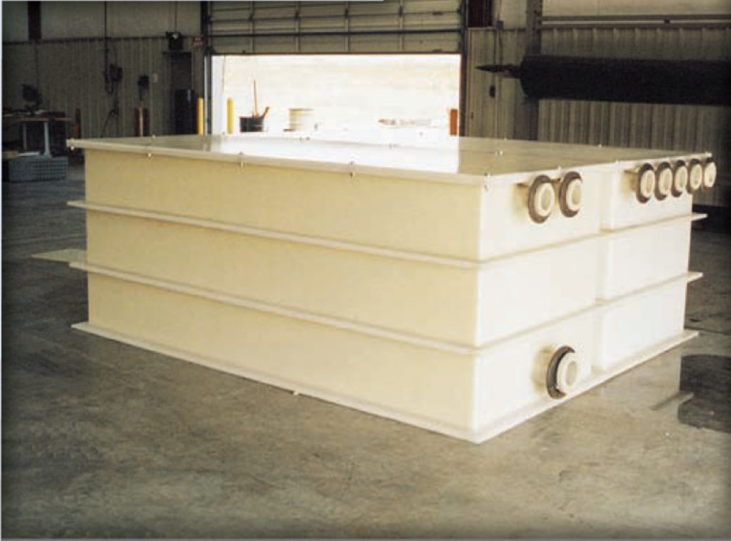
Homopolymer And Copolymer Polypropylene Sheet