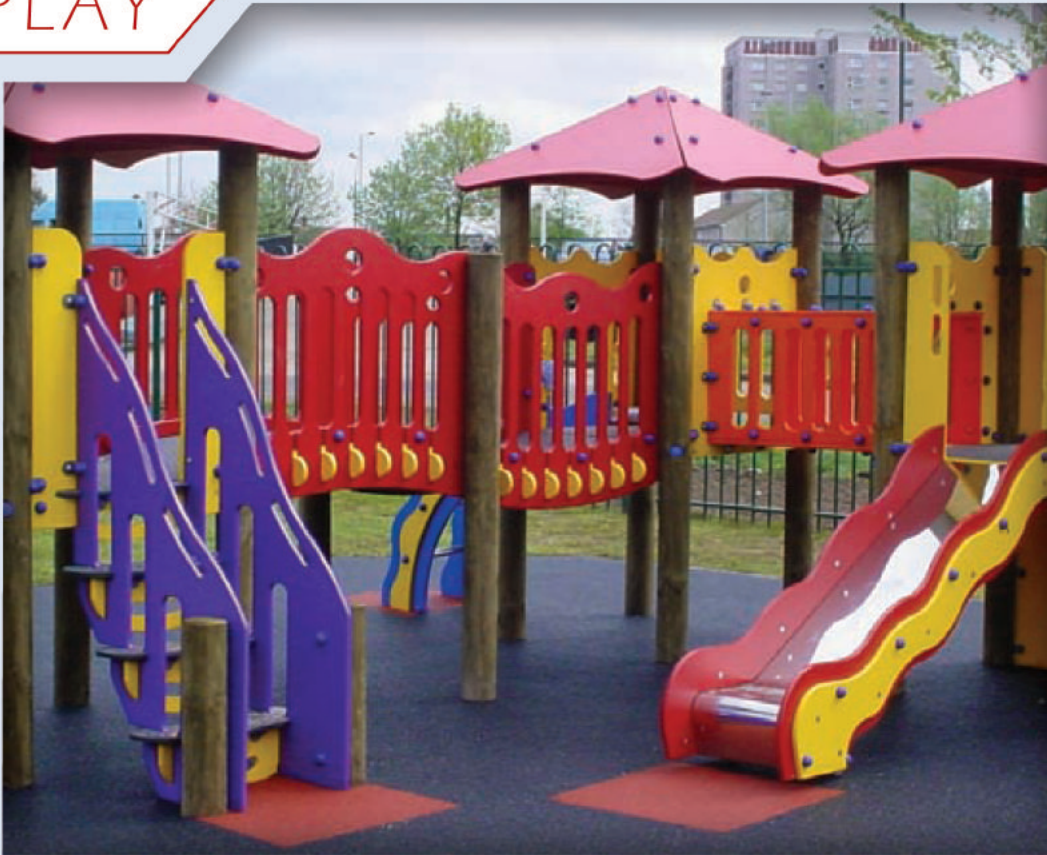
High Density Polyethylene Sheet – PE 300