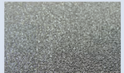
Desert Sand Finish