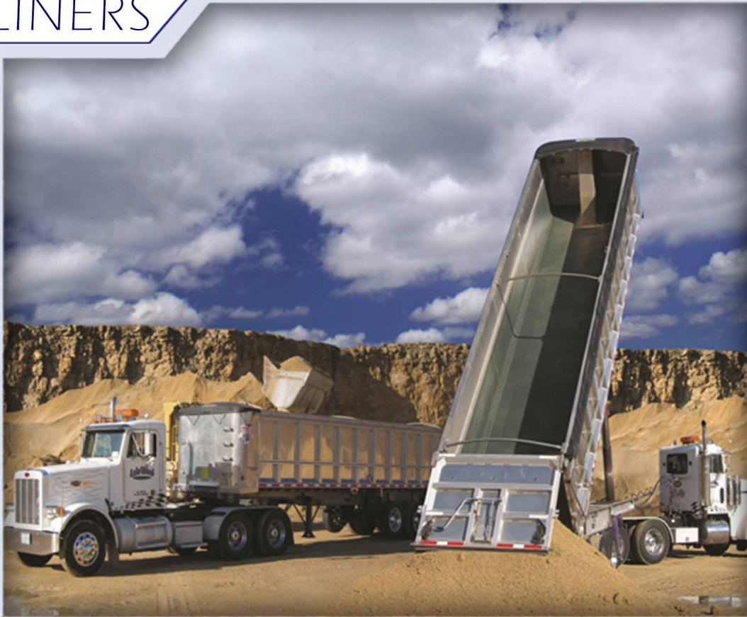
Seamless High Molecular Weight and Ultra High Molecular Weight Polyethylene Liners